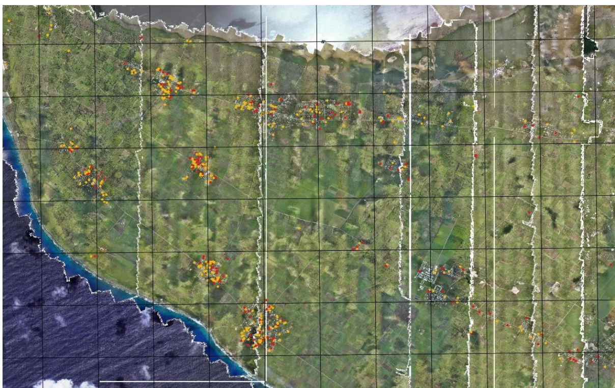
Figure 2: alt_text